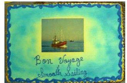
The Retirement Cake (one of several): "Bon Voyage and Smooth Sailing"