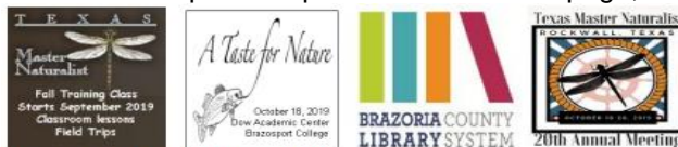
Size: 150x150 pix (about 2.1 inch).

Link to October General Meeting and Field Day posted with Quintana location cited Same four adspots still posted on the home page; he will remove training and BCLS adspots