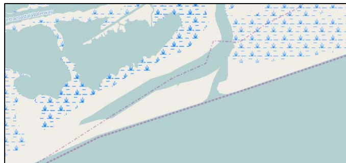
Fig. 1. Mouth of the San Bernard River, 2010.

Except that it doesn't. When the Corps of Engineers diverted the nearby Brazos River in 1929, silt from its new mouth