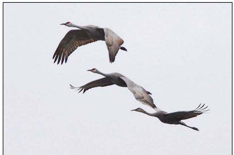
Sandhill Cranes