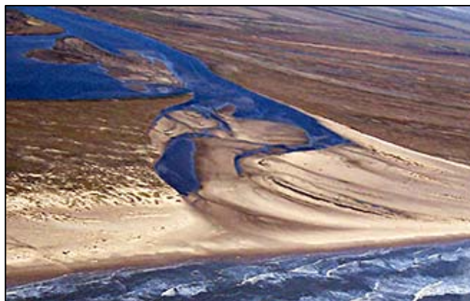
Fig. 3. Mouth of the San Bernard River, January 2013.

Is the Corps now going to have to spend $1 million of taxpayer money every year to keep the mouth open?