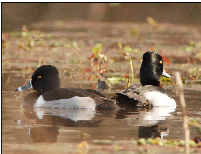
Ring-necked Duck