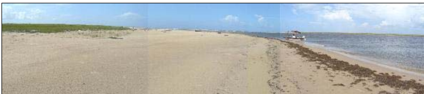
Fig. 2. Mouth of the San Bernard River, July 2010, looking southeast toward the Gulf of Mexico. Note the silt deposition on the northeast side of the river — a broad sandy beach, completely covering the channel dredged the previous year. Composite photo P1100648.JPG by Neal McLain. Public domain.

Image © 2012 OpenStreetMap contributors under the Open Data Commons Open Database License (ODbL). Cartography licensed under the Creative Commons Attribution-ShareAlike 2.0 license (CC-BY-SA). http://www.openstreetmap.org/copyright