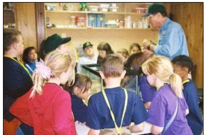
Leading a BP Amoco Environmental Education class. Chocolate Bayou Wildlife Conservation Center, 2005.