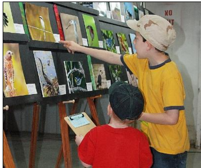
Kids pick their favorite images in the photo contest