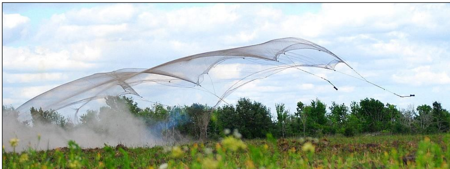
Rockets carry netting over a flock of duck decoys