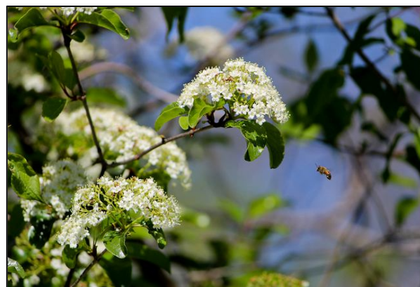
Rusty Blackhaw Viburnum