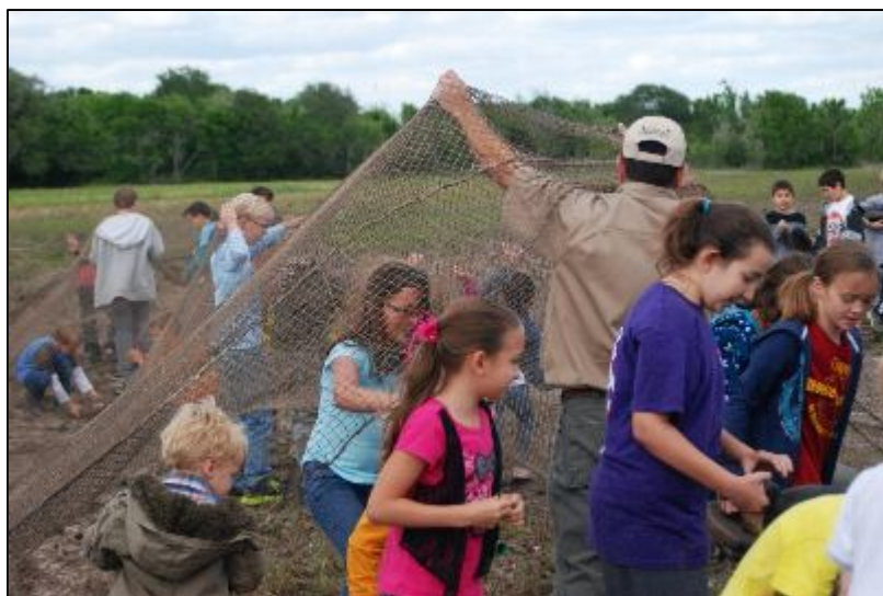
Kids scramble to catch the "ducks"