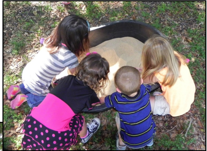
Above: Kids dug for eggs in a sand "turtle nest".