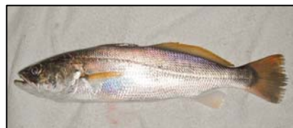
Sand Seatrout