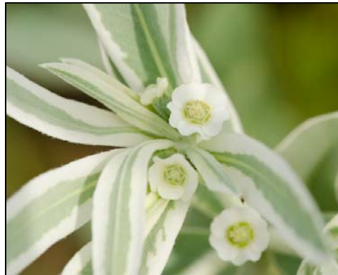
Snow on the Prairie