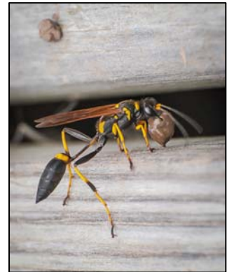
Black and Yellow Mud Dauber