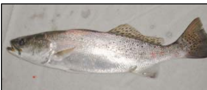
Spotted Seatrout