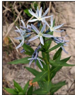
Showy Blue-Star