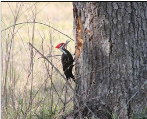
Pileated Woodpecker