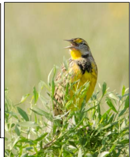
L-R: Dickcissel (San Bernard NWR, May 2013, Horned Lark male (Surfside Salt Flats, Oct. 2013, and Eastern Meadowlark, Brazoria NWR, Oct. 2013