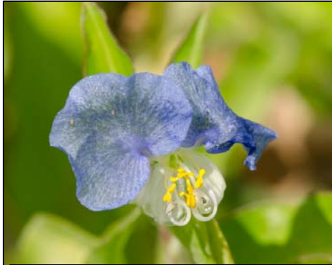
Whitemouth Dayflower, Brazoria NWR

The Whitemouth Dayflower ( Commelina erecta ) is said to be named for the three Dutch botanists named Commelin. The two large blue petals represent the two Commelin brothers that were published botanists, while the inconspicuous white petal represents the third brother that did not accomplish much. ( USDA Plant Guide, Erect Dayflower )