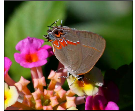
Dusky-blue Groundstreak, Brazos Bend State Park

Eggs are laid in leaf litter on the ground. Caterpillars eat dead leaves and fruits, and detritus.