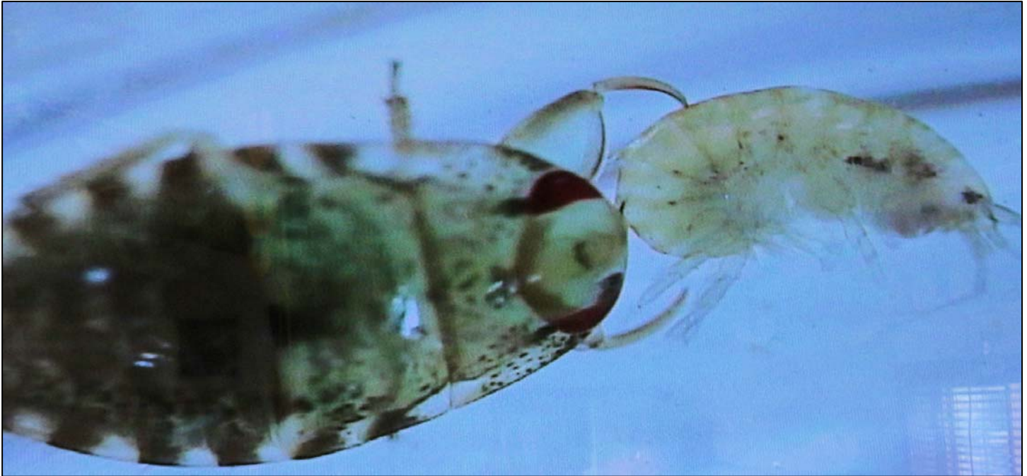
Creeping Water Bug [ Pelocoris femoratus ] (left) attacks the Scud ( Hyaella azteca )

"half wing," referring to the fact that part of the first pair of wings is tough and hard. Hemipteras are deemed to be true bugs with over 35,000 species. They are predators possessing a piercing beak to kill their prey. They then inject enzymes to dissolve the tissue then ingest the liquid back through their beak. If a Hemiptera bites your finger it can be quite painful, the pain lasting about five minutes. These water bugs also tend to be pollution tolerant and closely resemble their parents, except that the young do not possess wings.