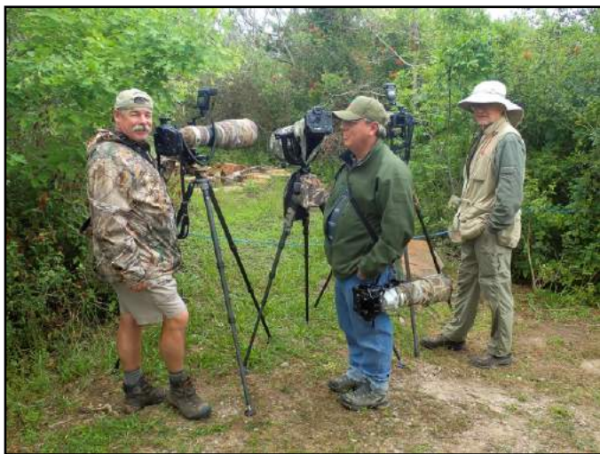
Photographers and birds alike enjoy 'camping out' at the water features at QNBS.

The Quintana Neotropical Bird Sanctuary is located across from the Quintana City Hall on CR723, Quintana Road. It contains both wooded and xeriscape areas.