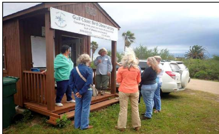
Volunteers training to staff the host station in 2016