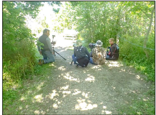
Visitors with binoculars and cameras both delight in sighting birds at QNBS. Visitors average about 40 per day, but a peak day can bring up to 100 visitors to the site.

QNBS Volunteer Facts 2018 35 Volunteers staffed host station (most volunteers were Master Naturalists) 459 Volunteer hosting hours at QNBS station