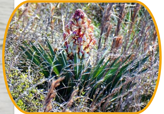
Above left: Red-breasted Mergansers ( Mergus serrator ) in the bay at Rockport. They winter farther north and farther south than any other American mergansers and also prefer salt water more than the other two species of mergansers (common and hooded). Right: Another sign of Spring: The first blooming Yucca plant Captain Moore had seen along the Intracoastal.