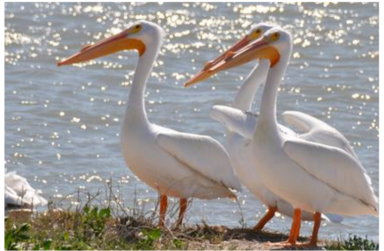
Above left: Osprey Carrying a Fish. The Osprey ( Pandion haliaetus ) always carries its catch head-first in order to reduce drag while flying. Right: These American White Pelicans ( Pelecanus erythrorhynchos ) winter on the Texas Coast and are beginning to show breeding plumage. Their beak bumps will disappear after the breeding season. Their wing spans can exceed nine feet, whereas whooping cranes' is seven feet. A White Pelican's bill can hold three gallons of water.