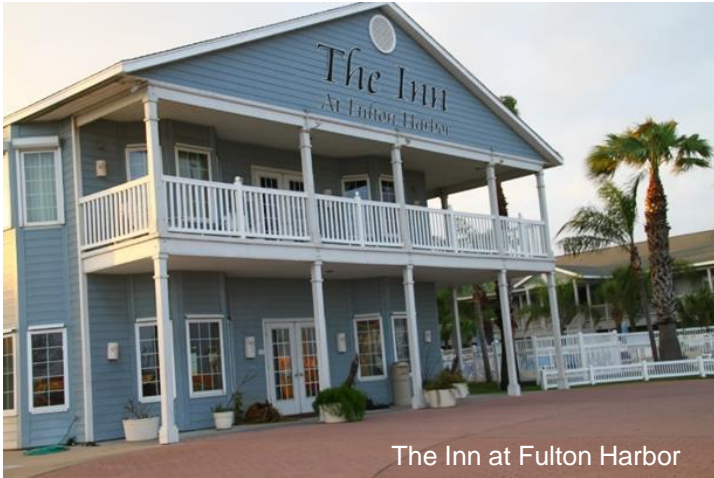
The Inn at Fulton Harbor