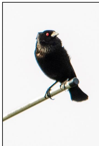
The thick foliage of the QXNR provides great habitat and food for migrating birds.

QNBS Volunteer Facts 2018 35 Volunteers staffed host station (most volunteers were Master Naturalists) 459 Volunteer hosting hours at QNBS station