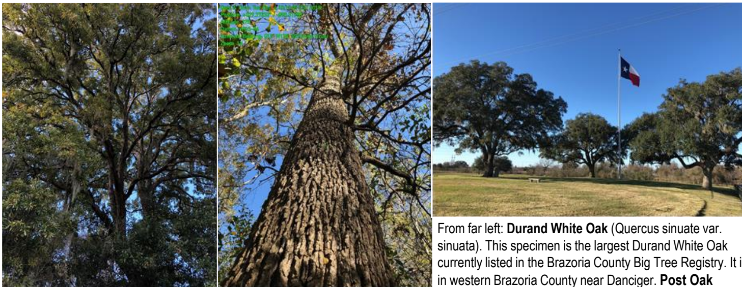
From far left: Durand White Oak ( Quercus sinuata var. sinuata). This specimen is the largest Durand White Oak currently listed in the Brazoria County Big Tree Registry. It is in western Brazoria County near Danciger. Post Oak ( Quercus stellata). This specimen is located at the Krampota-Lance Chocolate Bayou Preserve near Alvin. Southern Live Oak ( Quercus virginiana). These oaks are located at the Stephen F. Austin death site a few miles north of West Columbia.

If you have or know of a big tree and it is bigger than the ones in the list, please submit a nomination. Or, if you have a species that is yet not in the list, tell us about it. If big trees that can compete at the state level are discovered during our county-level project, we can provide assistance to forward the nomination to the Texas Forest Service.