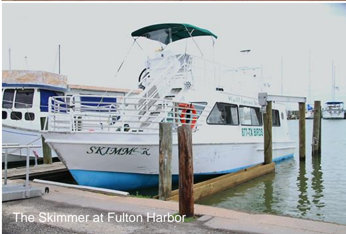
The Skimmer at Fulton Harbor