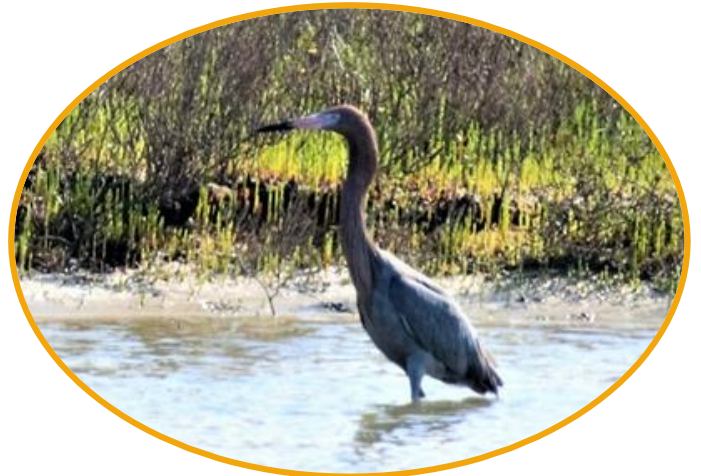
Above left: Great Blue Heron roost near Rockport. These Ardea Herodias use a tree in the bay to roost and prepare nests for the upcoming breeding season. Right: The Reddish Egret ( Egretta rufescens ) is an endangered species found only in coastal salt marshes along coastal areas of Mexico, the U.S. Gulf Coast, the Caribbean, and parts of Central America. The TP&WD estimates only 1,500 to 2,000 nesting pairs remain in the U.S. Destruction and degradation of their coastal habitat are its greatest threats.