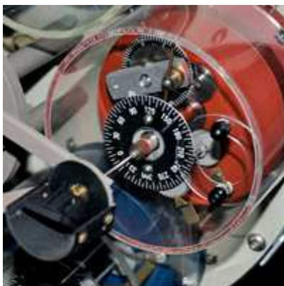
Analog computer for tracking the position of Mars.

In addition to the independent planet motions, four major star-field motions are reproduced: (1) daily motion, (2) annual motion, (3) latitude, as determined by the desired observer's position on earth, and (4) precession of the polar axis. In addition, the A4 model provides for azimuthal rotation, allowing the field to be turned for the convenience of presenting a particular region of the sky to the audience.