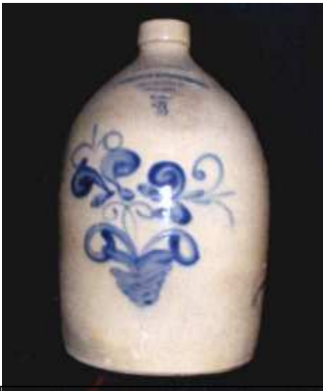
Salt-glazed stoneware recovered from the Acadia

Brazoria County Historical Museum 100 East Cedar Street Angleton, Texas 77515 http://bchm.org Free